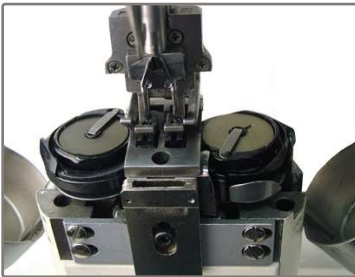
LARGE HOOKS MADE WITH BLACK FINISHED STEEL