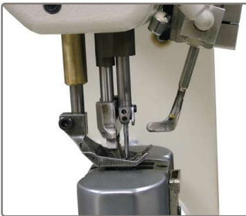
UPPER AND LOWER POSITION CENTRAL PNEUMATICAL GUIDE